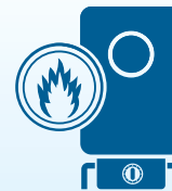
Gas Water Heater

• BACKUP GENERATOR A natural gas generator can run electric appliances like refrigerators and furnaces. The best part is that the generator automatically switches on when the power goes out.